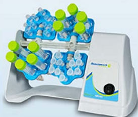
Roto-Mini™ Rotator Series