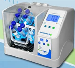
Roto-THERM™ Incubated Rotator Series